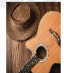
Country and Western Music and Dancing Friday Night