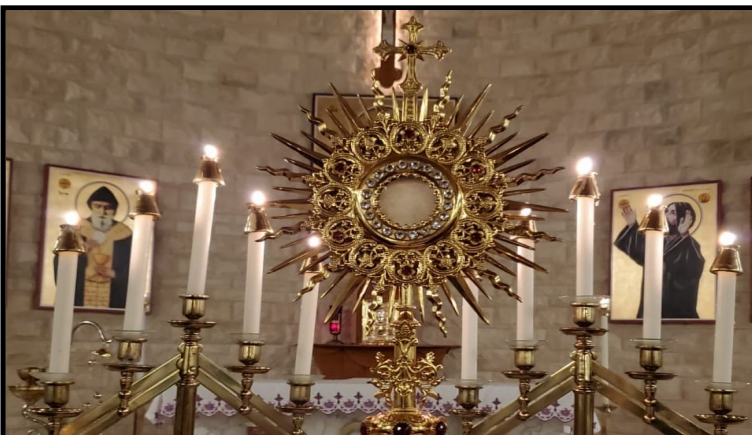
ADORATION OF THE BLESSED SACRAMENT Every Thursday 9:30 am- 12 pm